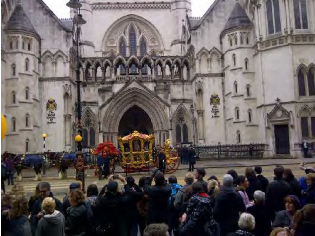
The Lord Mayor's coach outside the Royal Courts of Justice

Having escaped neither drenched nor too dishevelled last year, my fingers are crossed for good weather this coming November, when the Sea Cadets new display signage will get its first outing!