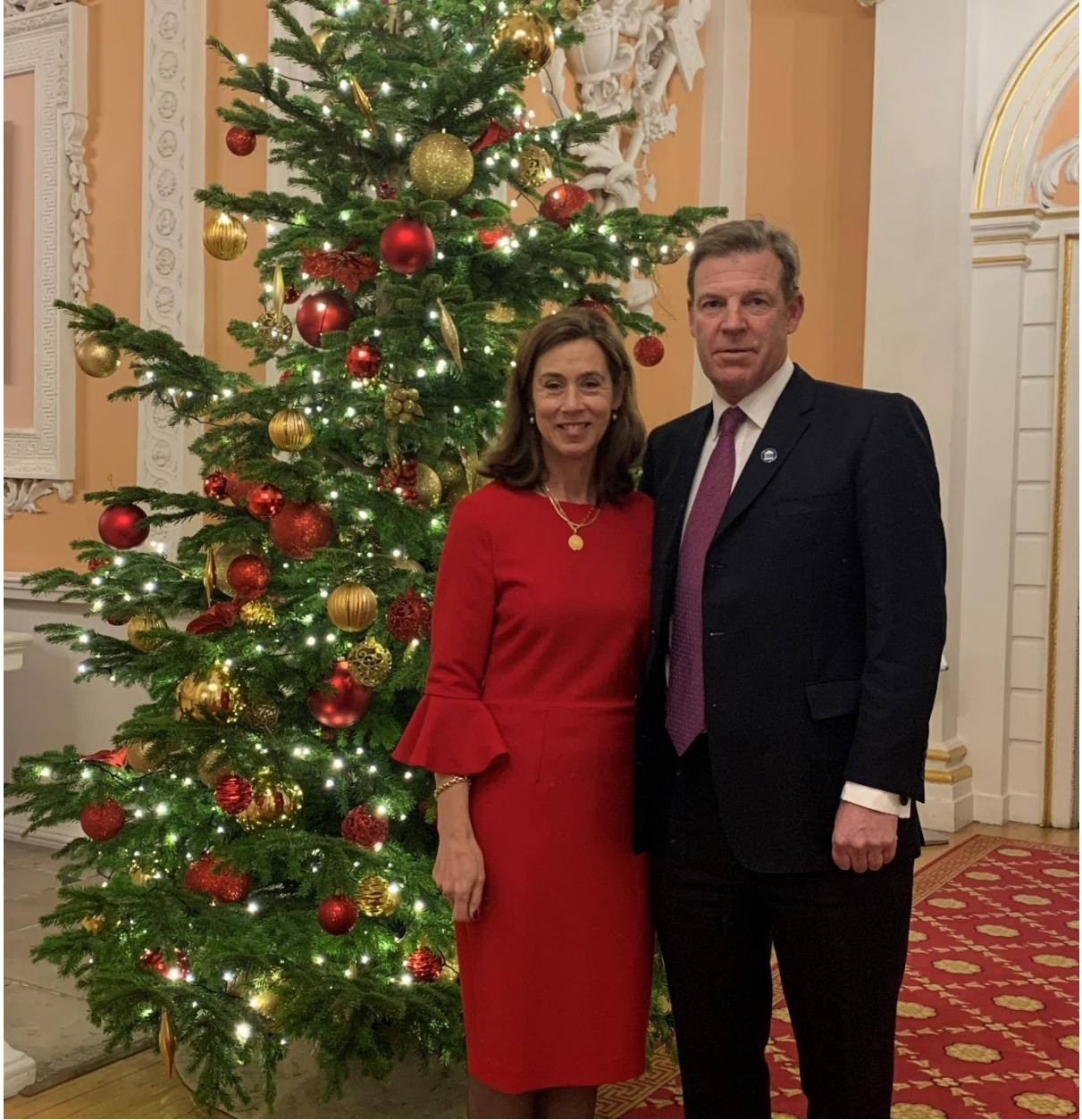
Merry Christmas from the Lord Mayor and Lady Mayoress